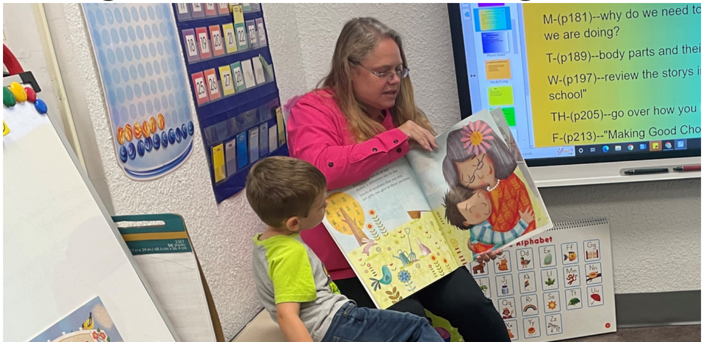
4K Students Learn About Kindness and Making Good Choices

Gilmanton School District PO Box 28 Gilmanton, WI 54743