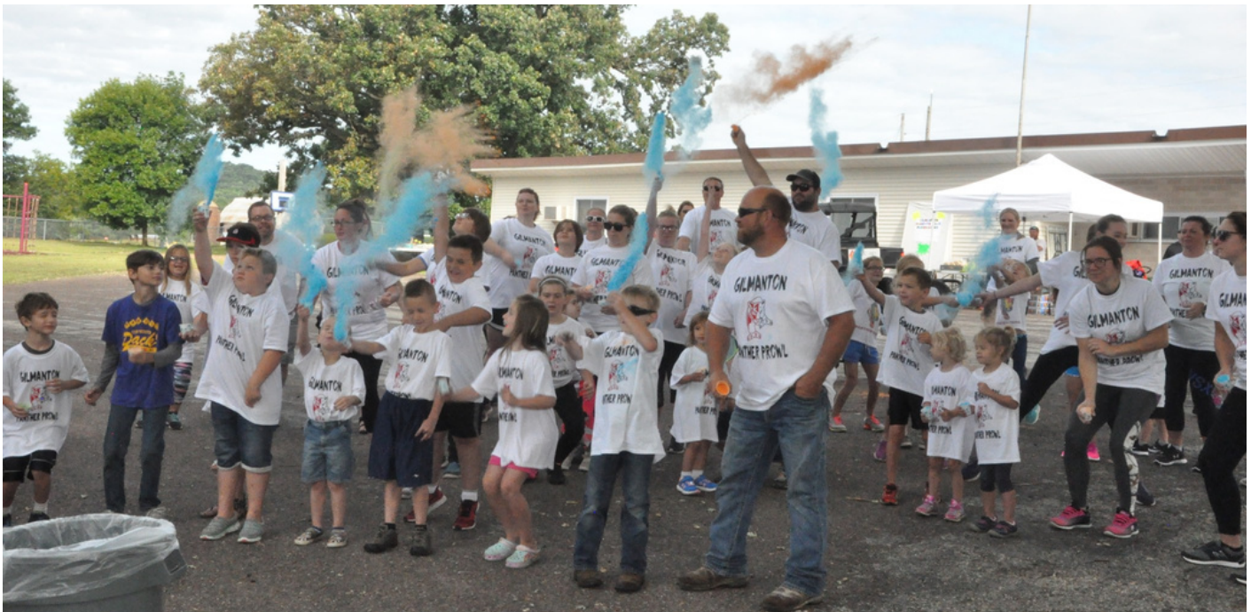
Parents Club Panther Prowl Color Run

Our Parents Club Provided School Supplies for All Students in 4K-8th Grade Last Year!