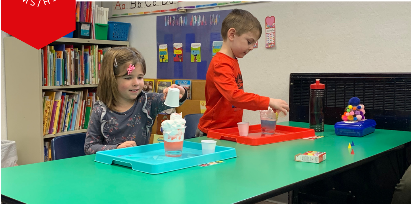
4K Science: Learning About Thunderstorms and Making Thunderstorm Clouds

EDUCATIONAL OPPORTUNITIES FOR GRADES 4K - 12