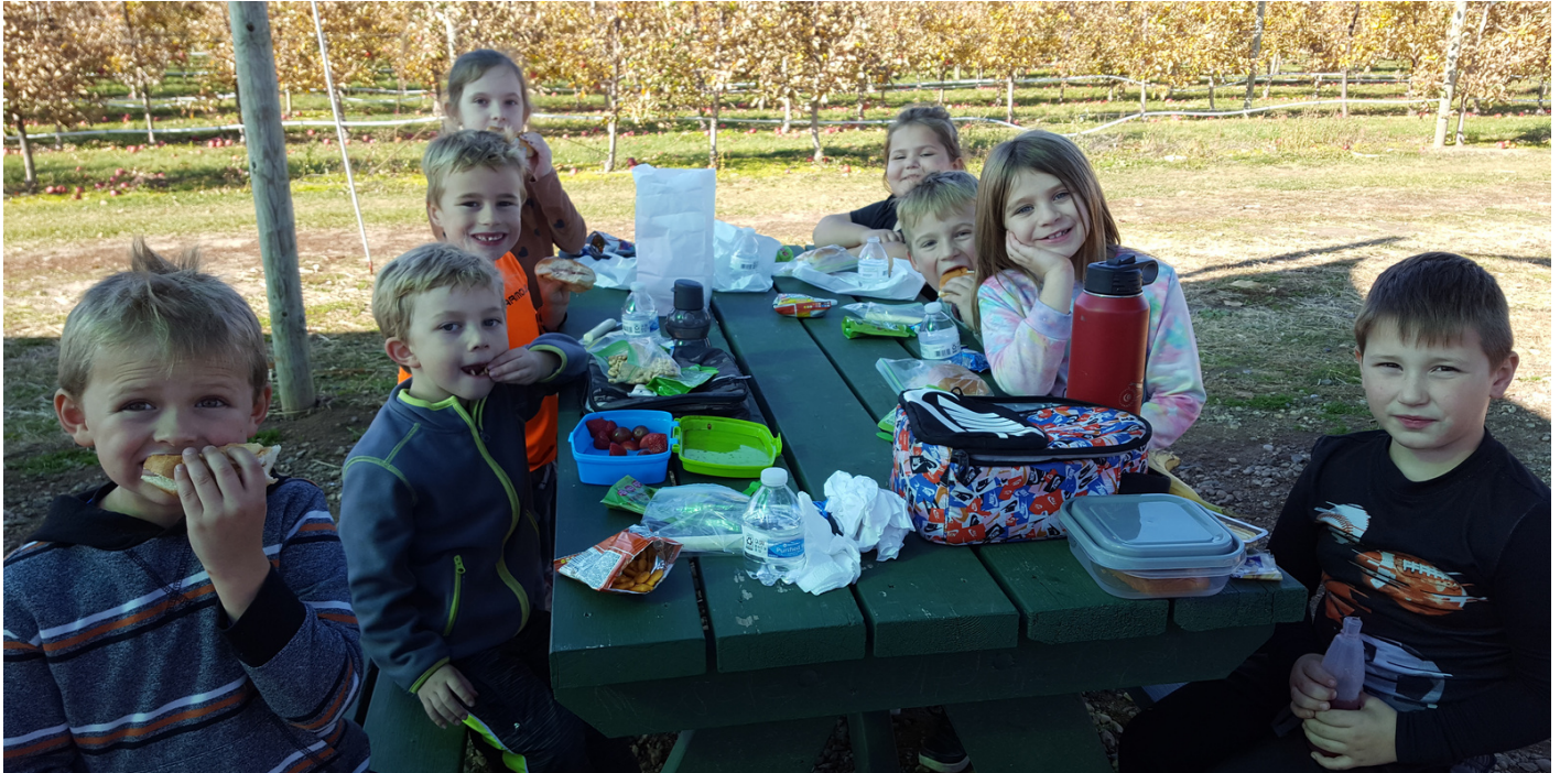
Field Trip to Ferguson's Orchard