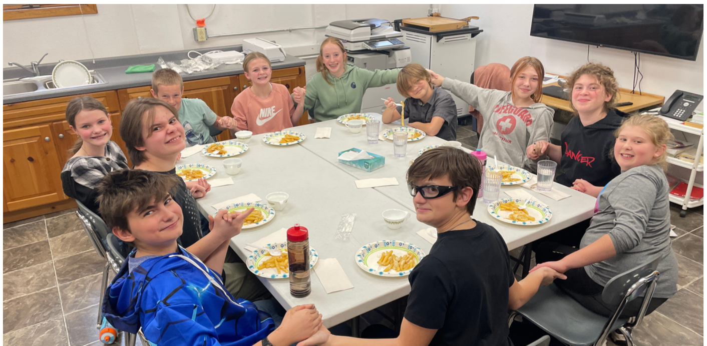
7th Grade Geography Study of North America Concluded With Cooking a Meal of Poutine (Canadian Cuisine)